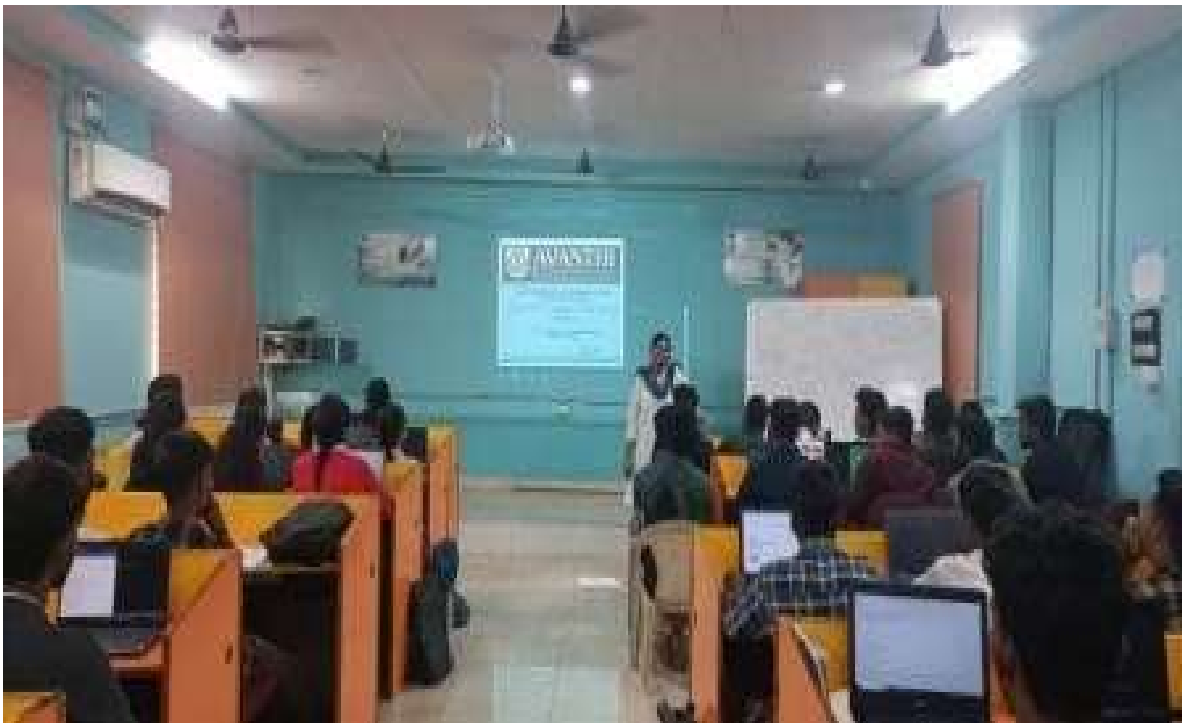
GATE -2021 ORIENTATION PROGRAM BY UN ACADEMY

Outcome: A Resource person from UN academy has started the gate awareness session in lively manner by asking questions on gate program and continued answering in such a way creating awareness of gate exam. The entire session held as a fruitful outcome and participated students felt very happy with this program. In this program all final year students participated.